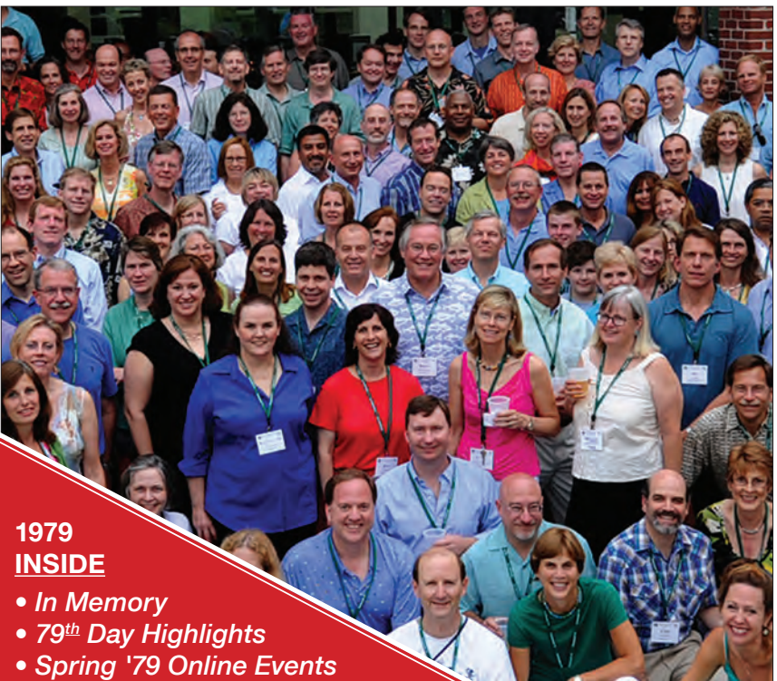
Detail from Class of 1979 photo taken at our 30 th Reunion, Sat., June 19, 2009